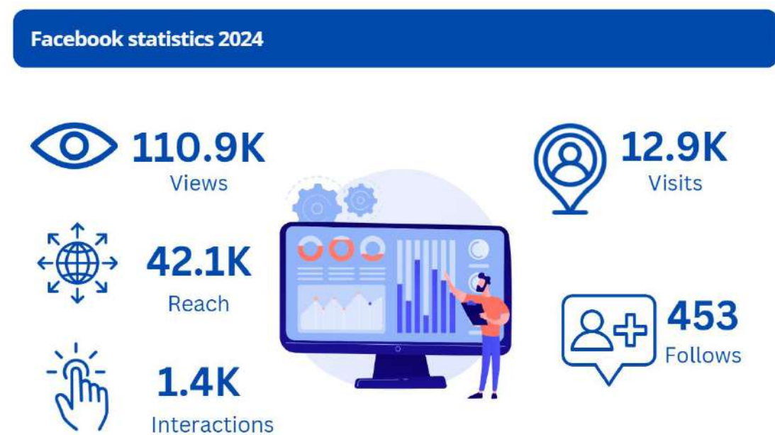
Figure 3: Key performance indicators (Facebook)

In 2024, the General Audit Chamber achieved 110.9K views, a reach of 42.1K (+173.9%), 1.4K interactions (+762.5%), 12.9K visits (+1.2K%), and an additional 453 followers. Figure 3 illustrates the results.