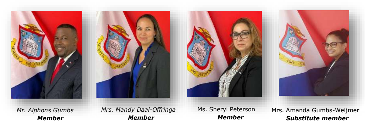
Figure 1: Board of the General Audit Chamber in 2024

The board typically meets every two weeks. In 2024, there were 18 board meetings.