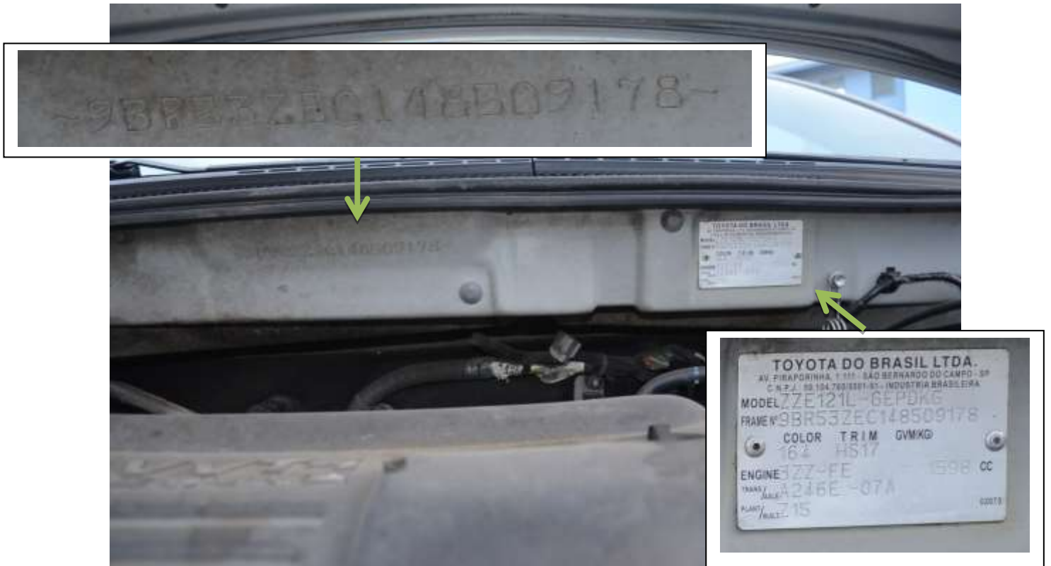
Another example of a VIN number on the left and the identification tag on the right. They should correspond