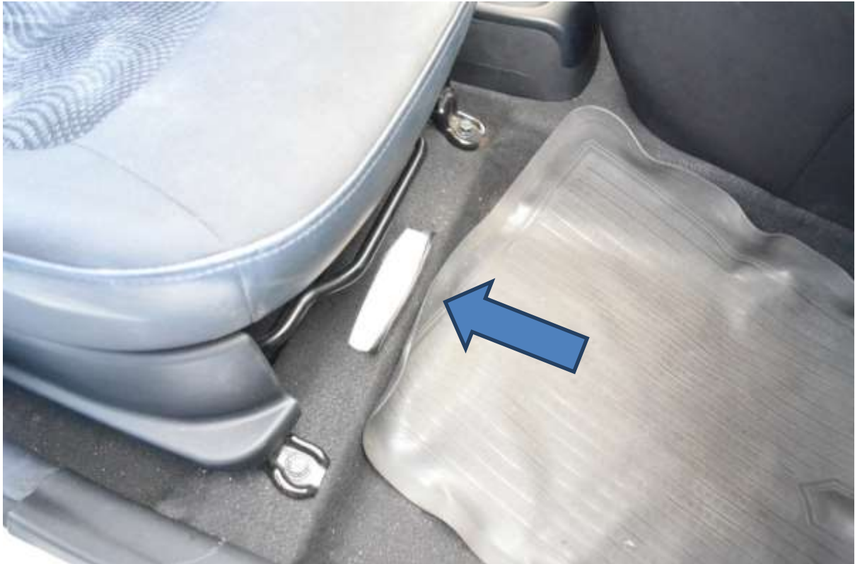
The VIN number located on the base plate of the front passenger's seat. This number has been ground away.